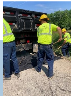
Dug out and replaced 18" storm culvert across Mounts Road

Fillmore Construction completed Culvert Repairs on Baxter Road